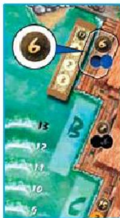
fig. 13b: Only the ginseng punt landed at the shipyard. The BLACK player has an accomplice there, but he placed him on the space for two punts landing (shipyard space B) in the shipyard, so he gets nothing. In der Werft ist nur der Ginseng-Kahn gelandet. To repair the ginseng punt the BLUE player, as insurance agent pays 6 PESOS to the harbor cash box.