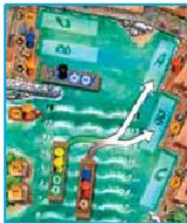
fig. 8: Only the silk punt arrived in MANILA. The other two punts failed to reach MANILA, or even space 13. They are both placed in the shipyard, in spaces A and B.

When only one punt fails to reach MANILA or be captured by pirates, it is placed on shipyard space A. A second punt failing to reach MANILA or be captured by pirates is placed on shipyard space B. If all three punts fail to reach MANILA or be captured by pirates, the last is placed on shipyard space C (see fig. 8a, 8b). No shipyard space can get 2 punts.