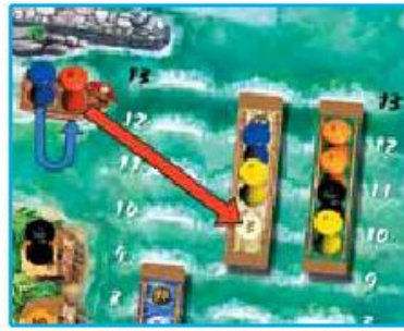
fig 9: After the second movement round, the jade and ginseng punts are both on space 13. The pirate captain decides to board. As there is only vacant space on the ginseng punt, he boards here. There is no further vacant space on either punt, so the second pirate moves forward to become the pirate captain.

When the pirate captain boards a punt, the second pirate immediately becomes the pirate captain, moving to the forward position in the pirate boat. If there are several punts standing on space 13 after the second movement round, the pirates are free to choose which, if any punts to board, but must board vacant spaces only.