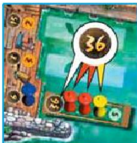
fig. 12: The jade punt arrived in MANILA with 3 accomplices on board. Therefore, each accomplice receives a third of the 36 PESO profit. The red player gets 24 PESOS, as he has 2 accomplices on the jade punt; the yellow player gets 12 PESOS for his accomplice on the jade punt.