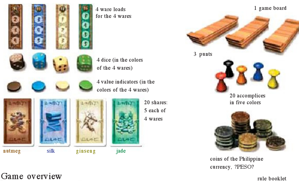
fig. 1: showing the contents, game board descriptions