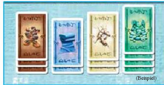
Abb. 2a: Die nicht an die Spieler ausgeteilten Anteilscheine werden offen neben dem Spielplan ausgelegt.

Place the punts, ware loads, and dice next to the game board.