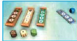
fig. 4: the harbor master decided not to load silk.

Now the harbor master takes his second official act: he loads one ware on each of the three punts. It is his decision alone, which ware he does not load (see fig. 4).