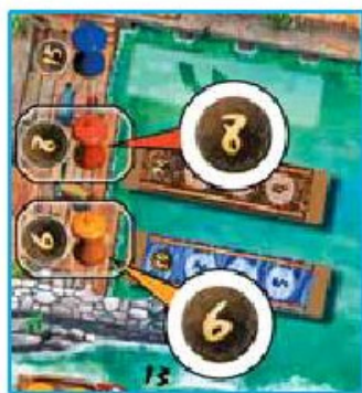
fig. 13a: Because 2 punts reached the destination port, the ORANGE player earns 6 PESOS and the RED player earns 8 PESOS. The BLUE bet on all 3 punts reaching MANILA, but lost, so he earns nothing for this accomplice.