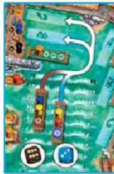
fig. 7: The jade punt reached MANILA in the second round and now occupies port space A. In the third round, the other two punts reach MANILA. They are placed on port spaces B and C, without regard to which is placed where. If one of these two had not reached MANILA, port space C would remain vacant, and this punt would be placed on shipyard space A.

Each punt which travels past space 13, reaches its destination port of MANILA. The first punt to reach MANILA is placed in port space A, the second is placed in port space B, and the third is placed in port space C (see fig. 7). No port space can get 2 punts.