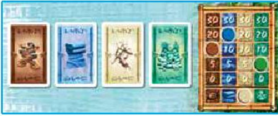
fig. 3: a nutmeg share currently costs 10 PESOS and a silk share costs 20 PESOS. Ginseng currently has no value on the black market, but the harbor master would pay 5 PESOS for a share, as he would for a jade share, which is currently valued at 5 PESOS on the black market.

First, the harbor master decides whether he wants to buy a share. If he decides to, he takes the desired share from the game board and pays the cost to the harbor cash box. The cost of a share is determined by the current value of the ware on the black market associated with the share. However, the minimum price is always 5 PESOS.