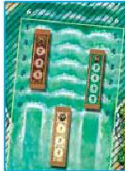
fig. 5b: the harbor master may place a punt on space 0, if the sum of the other two positions (e.g. 4+5) is equal to 9. Remember, that no punt may start in a position higher than space 5 (spaces 0 to 5 are marked to reinforce this rule).