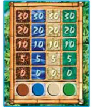
Abb. 2b: Der Stand auf dem ?Schwarzmarkt? zu Beginn des Spiels.