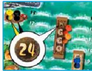
fig 10: The nutmeg punt stands on space 13 after the third movement round. All accomplices on the punt are returned to their players with no profit. The pirates share the profit from the nutmeg punt of 24 PESOS (12 PESOS each) from the harbor cash box.

When a punt stands on space 13 after the third movement round and there are no pirates on the pirate boat, it is placed on the next vacant port space.