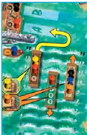
fig 11: The last accomplice placing round has ended. Before the last punt movement round, the harbor master pauses to give the pilots the opportunity to use their influence. The "small pilot" chooses to move the nutmeg punt forward by one space. Because the nutmeg punt has now arrived in MANILA, the small pilot places it on the next vacant port space and the "large pilot" will not be able to move it. The "large pilot" decides to move the jade punt backwards one space and the ginseng punt one space forward to space 13. As the pirates are not now active, they cannot attack the ginseng punt.

When a pilot moves a punt to space 13, nothing happens (the pirates only attack immediately after the movement round).