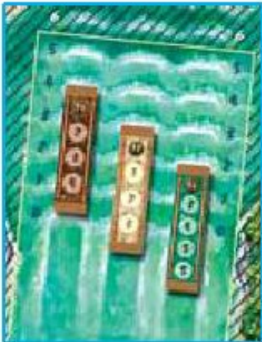
fig. 5a: when one sums the 3 start positions, the must always equal 9. For example, one punt can begin in space 4, another in space 3, so the last would have to be in space 2.