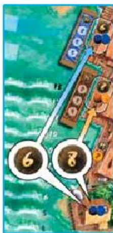
fig. 14: For both punts that landed in the shipyard, the insurance agent must pay for repairs. He pays 6 PESOS to the BLUE player and 8 PESOS to the ORANGE player. However, as the BLUE is the insurance agent, he pays only the 8 PESOS to the ORANGE player.

The insurance agent player may first take his profits for the voyage before paying for the punt repairs. If he does not have enough cash to make the payments, he must take loans to cover the missing amounts (see ?take credit?). If he cannot raise enough cash, even with loans, to pay the entire amount, he pays all that he can and the rest comes from the harbor cash box. The player does not have to repay the amount paid by the harbor cash box in this case.